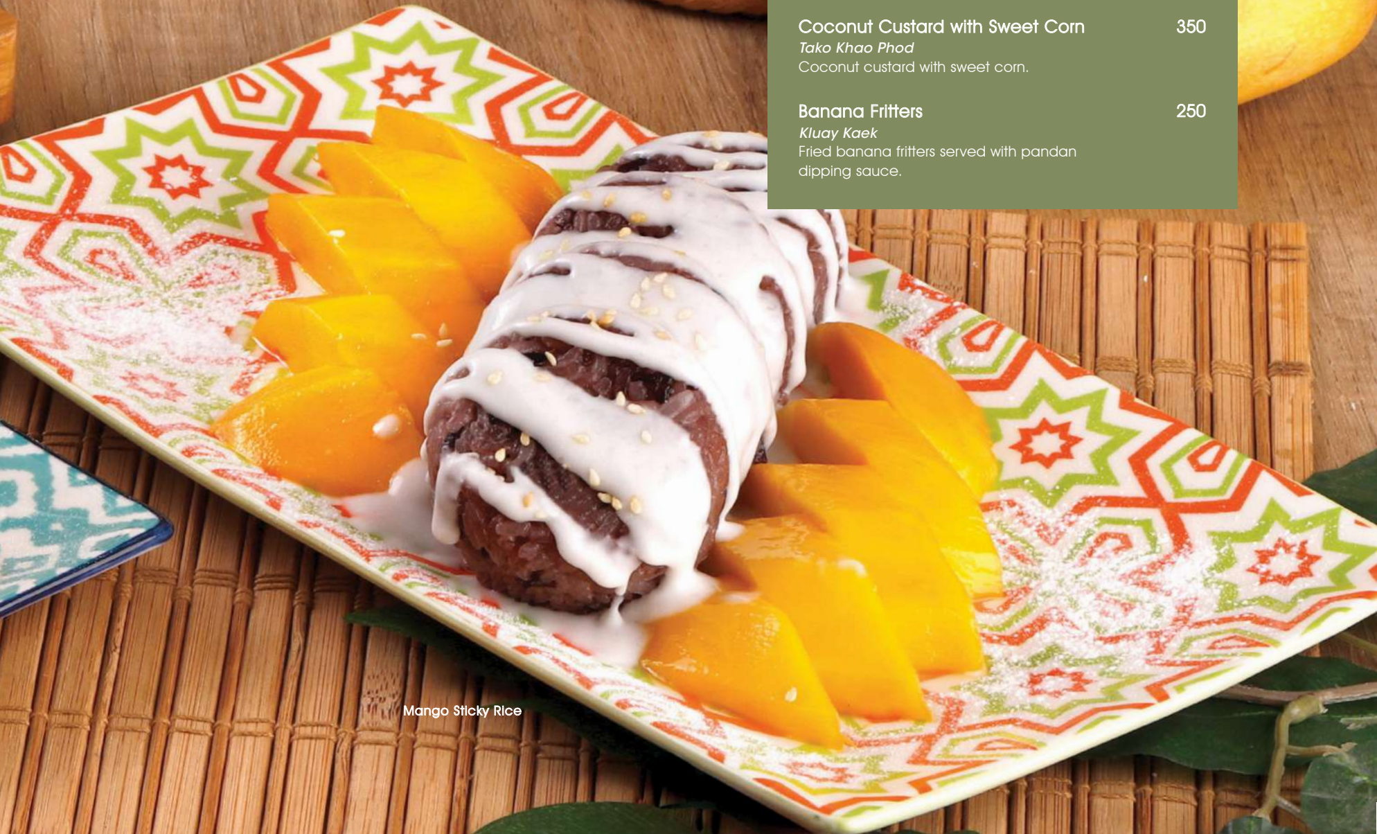
Mango Sticky Rice

Fried banana fritters served with pandan dipping sauce.