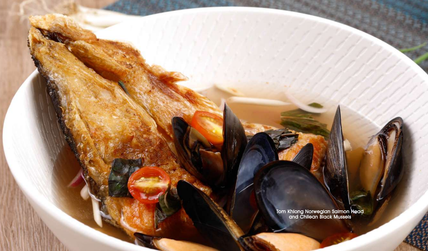
Tom Khlong Norwegian Salmon Head and Chilean Black Mussels