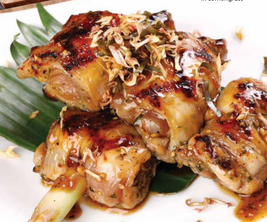
Chicken in Lemongrass