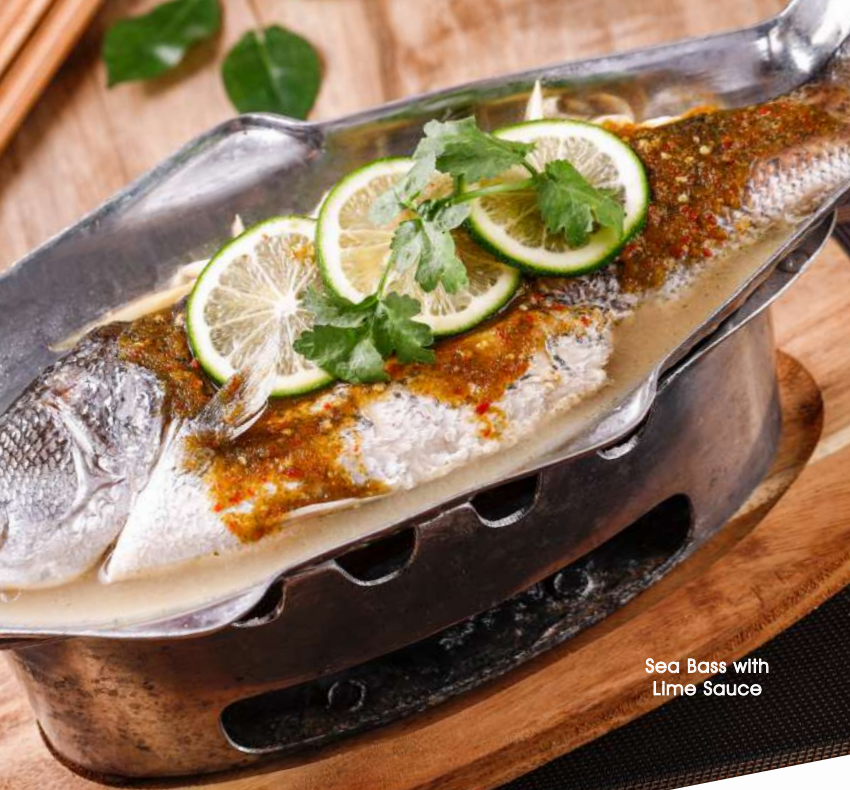
Sea Bass with Lime Sauce