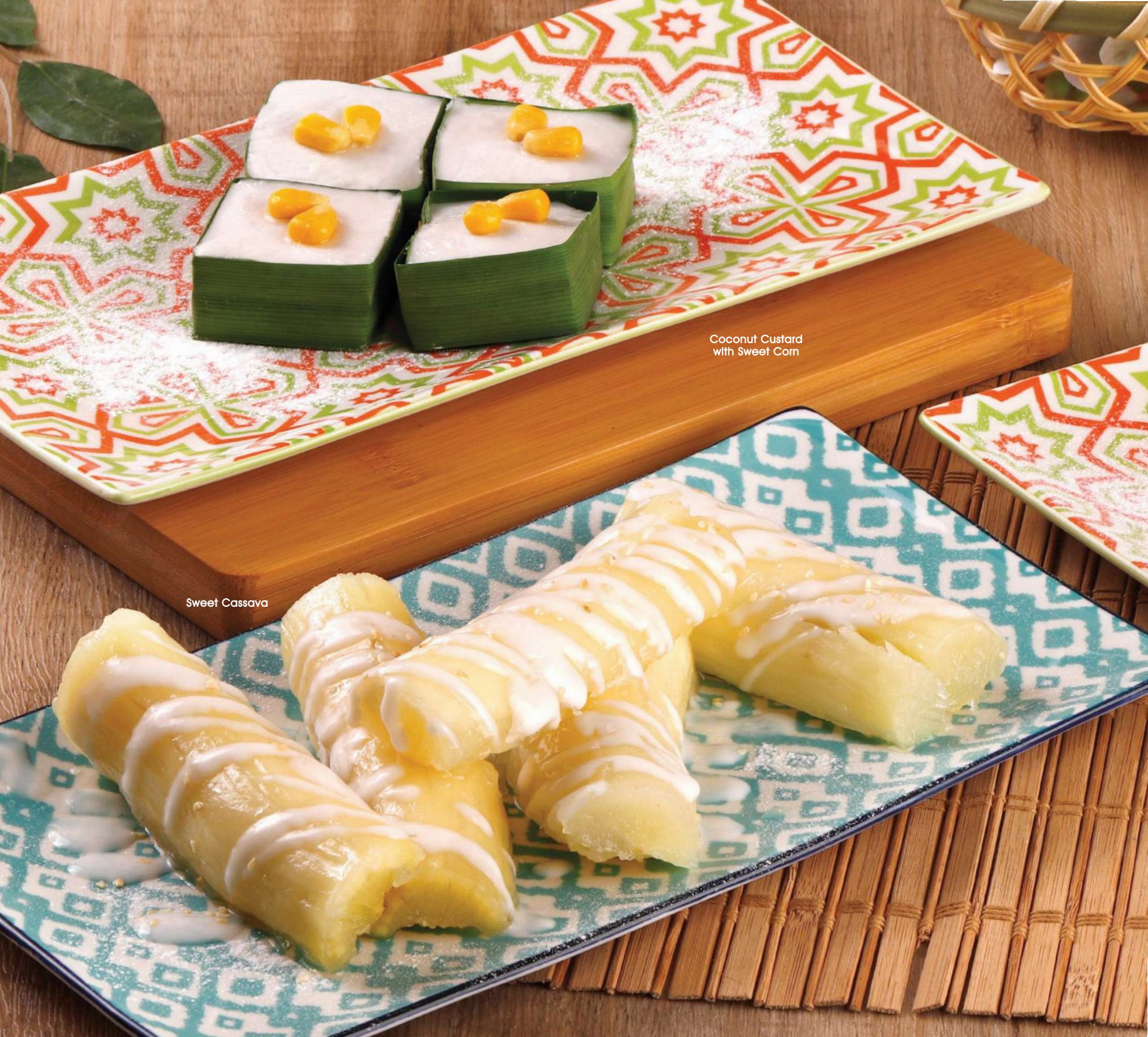
Coconut Custard with Sweet Corn