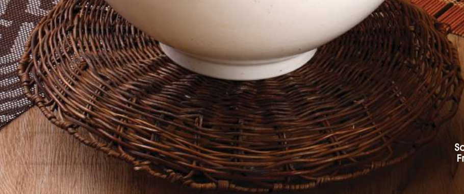
Salted Egg Fried Rice