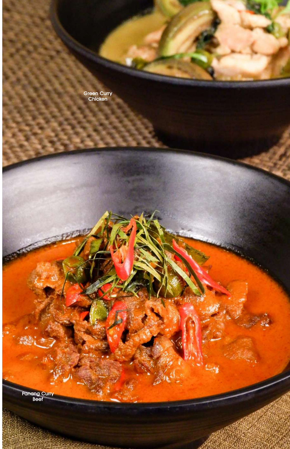
Green Curry Chicken

Prices are inclusive of VAT, exclusive of service charge. Menu prices and items may change without prior notice.