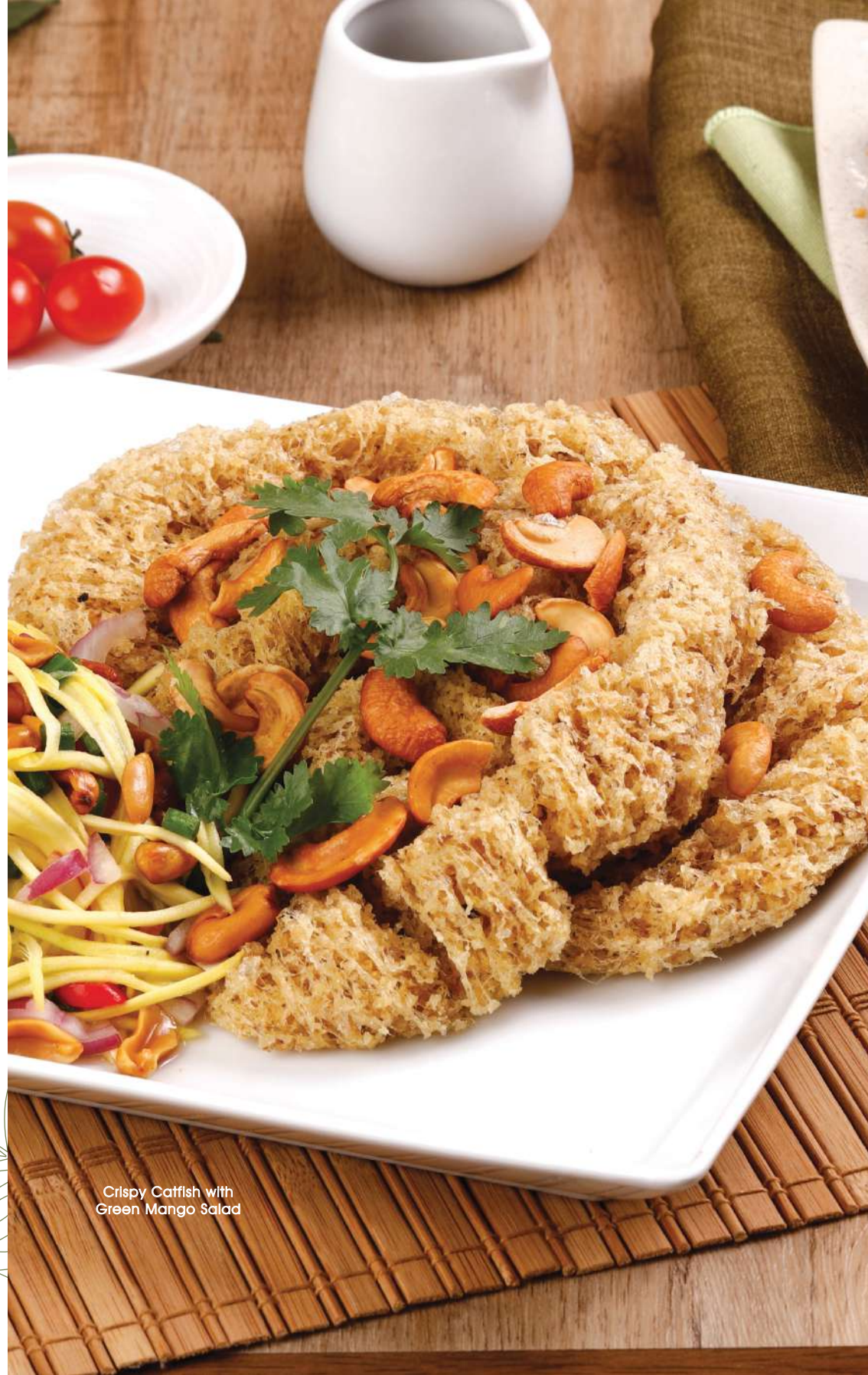
Crispy Catfish with Green Mango Salad

Grilled beef tenderloin with Thai dressing, onions, ground rice.